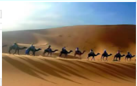
JAISALMER DESERT SAFARI