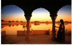
BIKANER PALACE HAWA MAHEL